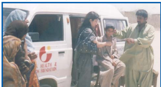
Our Mobile Van Conducting O P D at central location of 6 Villages at Hub Chowki/Kemari Division.

Your support will help us to provide the facilities to all other poor areas to save more lives.