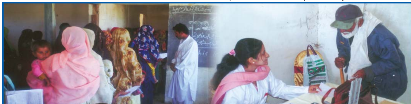
Mobile van carrying a doctor, paramedic and required medicines treating the patients at Mola Dad Goath.