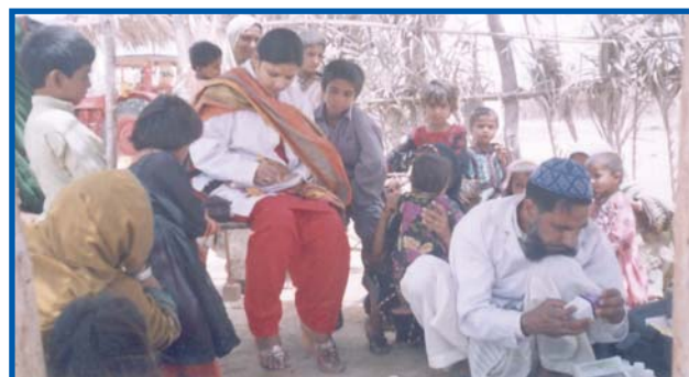
The Pictorial of a village near Karachi having no medical facility. CHAEF serves the patients through a mobile van carrying doctor, paramedic and medicines provided totally free.