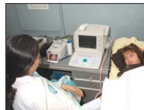
North Nazimabad Block S, Primary Health Ultrasound and MCH Centre (3 activities)