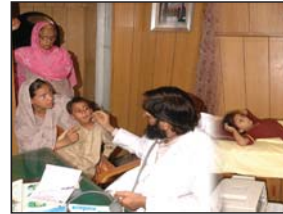
Nishtar Road - Primary Health Ultrasound and MCH Centre (3 activities)