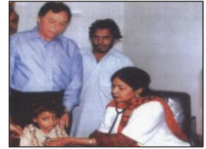
Metrovil - Primary Health Ultrasound and MCH Centre (3 activities)