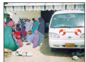
Soomar Goth - Primary Health Ultrasound and MCH Centre (3 activities)