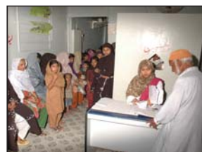
New Karachi - Primary Health, Ultrasound and MCH Centre (3 activities)