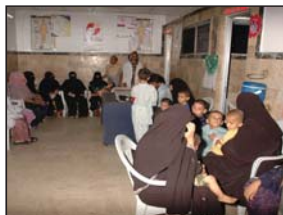
Akhtar Colony - Primary Health, Ultrasound and MCH Centre (3 activities)