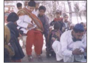
Primary Health Ultrasound and MCH at two goths (6 activities)

Please call or write for further information 0301-8235706 - 0301-8215709 E-mail: naeem@chaef.org